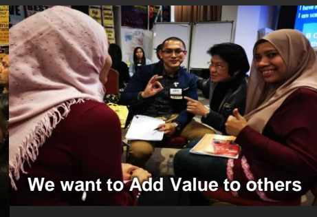
We want to Add Value to others