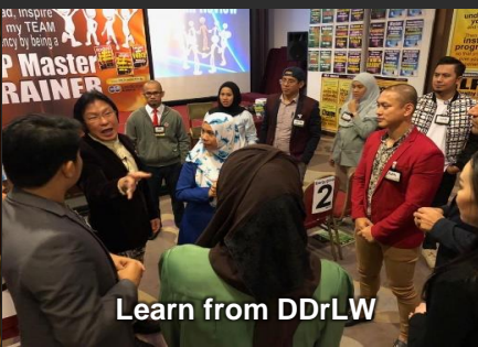
Learn from DDrLW